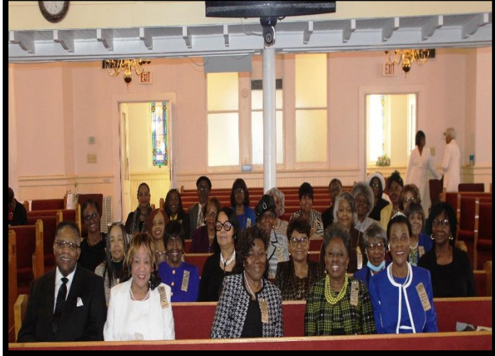
CREA Worshipped at St. Paul CME Church for Georgia Retired Educators Day on Sunday, November 5, 2023