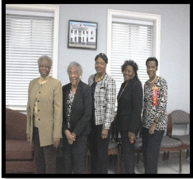
The Proclamation for Georgia Retired Educators Day from the Thunderbolt Town Council was read on November 8, 2023.