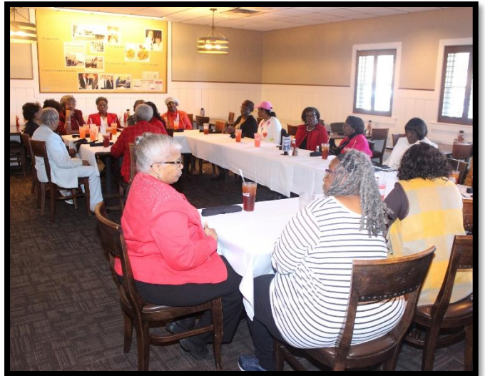
Chatham REA Leads The Way!