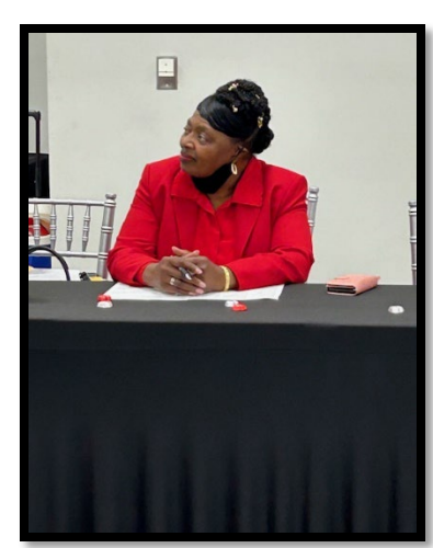
Chatham REA Leads The Way!